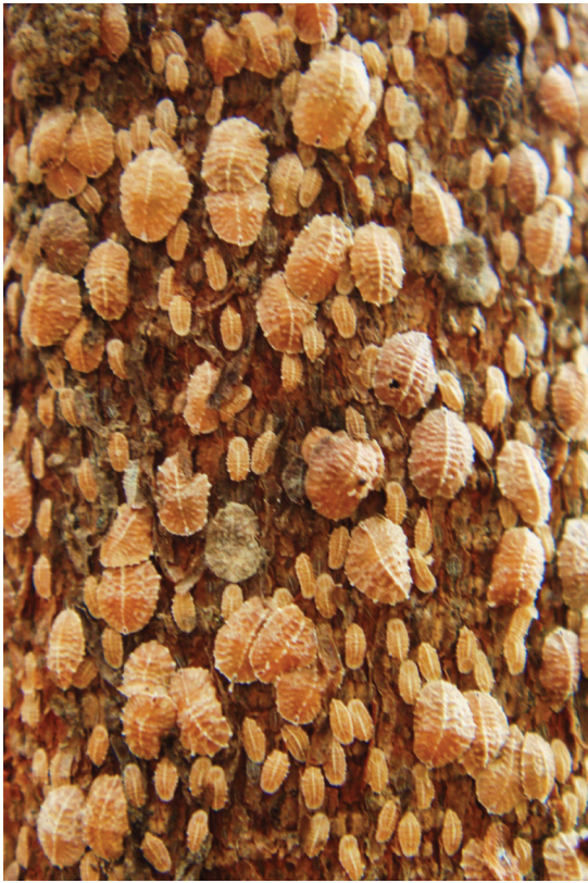
Figure 4. Colony of L. dendrobii in stem of X. aromatica .