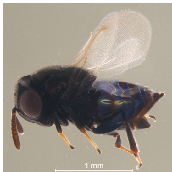
Figure 8. Adult female of Cephaleta sp., hymenopteran parasitoid associated with L. dendrobii .

(Hymenoptera: Encyrtidae), which have been observed on citrus in Tucuman, Argentina (Fidalgo, 1981). Blanchard (1938) also recorded the occurrence of a Signiphora species (Hymenoptera: Signiphoridae). Marietta caridei Brèthes, 1918 (Hymenoptera: Aphelinidae) has also been associated to L. dendrobii (De Santis, 1967), but, according to Hayat (1986), Marietta species are secondary parasitoids of Coccoidea. M. caridei , besides Argentina (Massini and Brèthes, 1918), also occurs in Brazil (Hayat, 1986) and Cuba (Hernandez and Ceballos, 1991 apud Noyes, 2014).