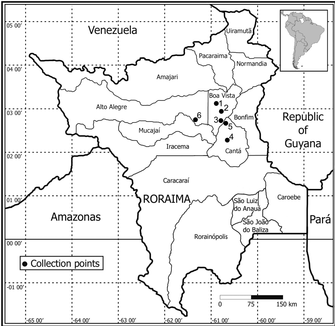
Figure 1. Map of the State of Roraima indicating the points in each municipality* and host plants where Lecanodiaspis dendrobii Douglas, 1892 was collected. * 1 Boa Vista, Acacia mangium and Xylopia aromatica ; 2 Boa Vista, Leucaena leucocephala ; 3 Boa Vista, Morus nigra ; 4 Cantá, Citrus reticulata ; 5 Cantá, Anacardium occidentale and Annona squamosa ; 6 Alto Alegre, Tectona grandis .