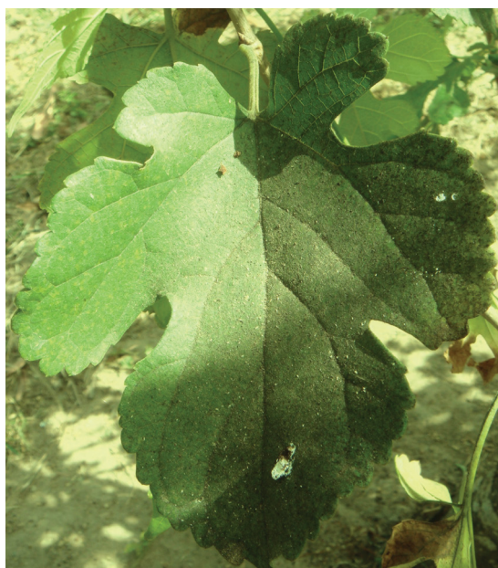
Figure 7. Sooty mold in leaf of M. nigra due to the honeydew excreted by L. dendrobii .