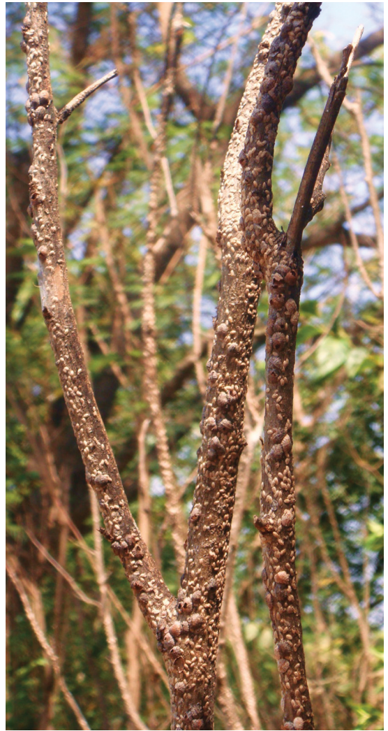
Figure 6. Death of young plant of L. leucophela due to infestation of L. dendrobii .

At short distances, immature stages of these insects are easily transported by wind, water or animals, whereas the dispersion over long distances is done mainly through transport by the host plants. For monitoring of the distribution of L. dendrobii in Roraima and other states, visual inspection would be the best method and, the main measure to reduce the spread of this insect is to avert that plants or part of plants infested by lecanodiaspidids can be transported to places free of this insect.