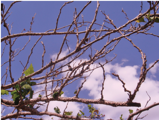
Figure 5. Drying of apical branches of M. nigra due to infestation of L. dendrobii .

At short distances, immature stages of these insects are easily transported by wind, water or animals, whereas the dispersion over long distances is done mainly through transport by the host plants. For monitoring of the distribution of L. dendrobii in Roraima and other states, visual inspection would be the best method and, the main measure to reduce the spread of this insect is to avert that plants or part of plants infested by lecanodiaspidids can be transported to places free of this insect.